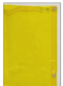
5270 Welding Screen